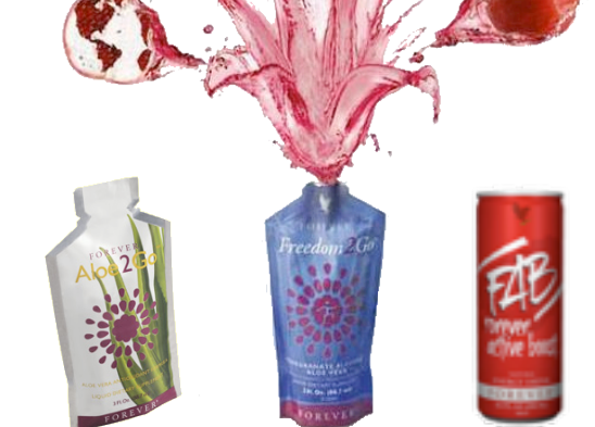
Aloe2Go and Freedom2Go – bursting with the best, ready to go with you wherever you go.