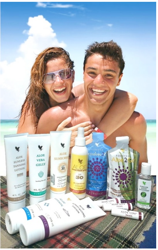
Best of friends for your holiday

Our lips are often vulnerable to the drying effects of sun and sea, so what better way to protect them than by keeping this excellent balm to hand at all times. It is small enough to fit in a pocket or handbag, and is ideal to take to the beach.