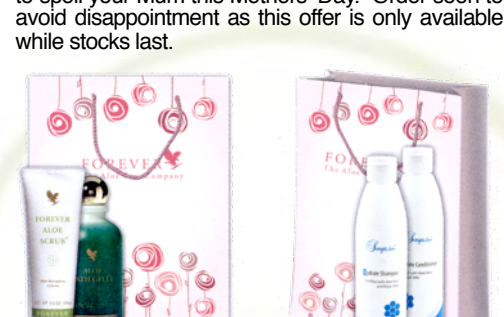
Bath Geleé & Aloe Scrub