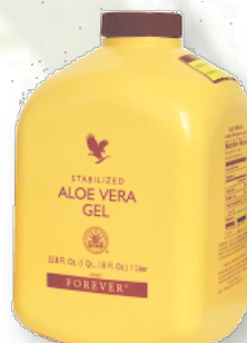
Forever Aloe Vera Gel: great for children and animals

Again, animals can suffer from nutrient deficiencies and many of Forever's huge range of supplements have a place in providing essential nutrients for our animal friends.