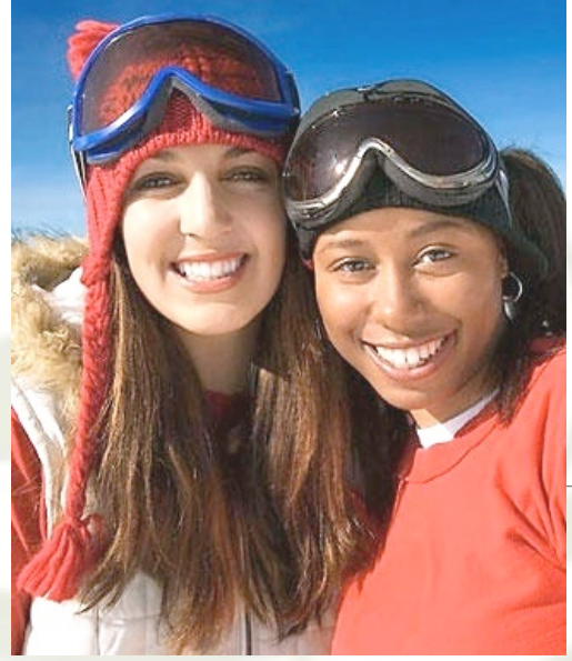
Forever offers the very best way to help you get in shape, give you lasting energy, and help you stay healthy.

This natural wonder has been used for centuries for its powerful properties and health benefits by numerous civilisations around the world. Forever has the very best available for you to use so you too can enjoy those benefits in a selection of four Aloe Vera Gel (natural flavour), Aloe drinks