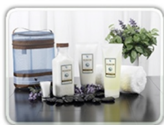
The Aroma Spa Collection