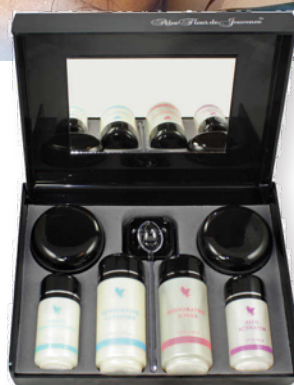
Aloe Fleur de Jouvence