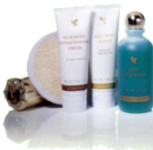
Aloe Body Toning Kit

Designed to trim, tone and tighten – minimising the bumpy texture of cellulite. Helps stimulate circulation and cleanses the skin to shed extra inches. The Body Toning Kit contains: Aloe Body Toner, Aloe Body Conditioning Crème, Aloe Bath Gelée, loofah mitt and cellophane wrap.