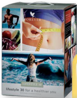
A selection from Forever's excellent weight management range