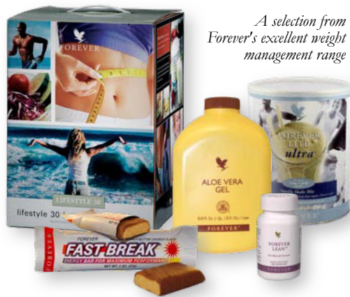
A selection from Forever's excellent weight management range