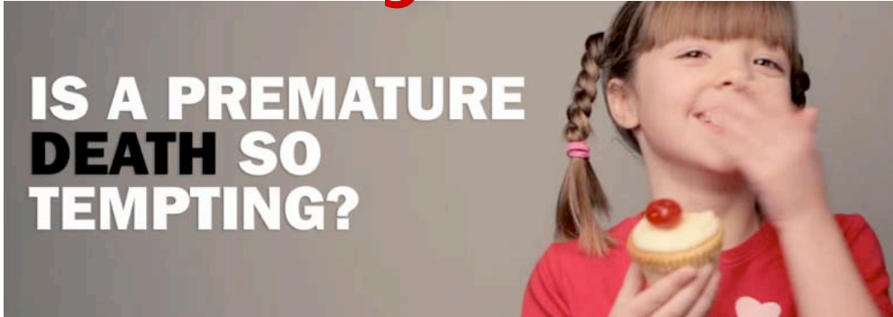
Shock advertisement from http://4yourkids.org.uk/ – But does it make you think about what you eat?

W e really are what we eat! Food is now as cheap as it has ever been in this country. Results from the Office for National Statistics show that the proportion of household income going on food and soft drinks now comes to just 15% (2006). That is less than half the share it took when the first Family Expenditure Survey was conducted 50 years ago.